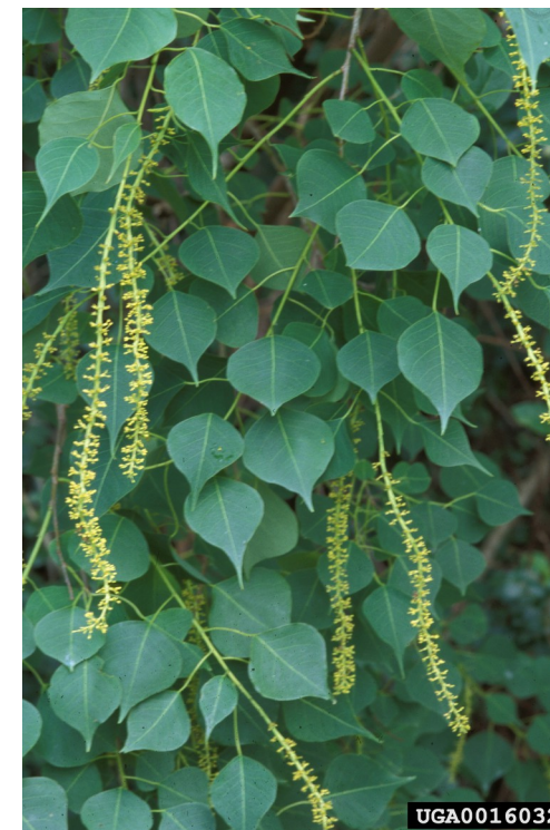
Leaves and flowers of a chinese tallow tree.

Folk Land Management, Inc. 3515 White Hall Road Green Pond, SC 29446