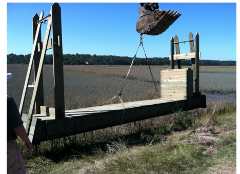
A ricefield trunk being positioned for installation

Use of provisions in the Managed Tidal Impoundment General Permit requires a property to be deemed eligible first. This is a simple process that involves written notification to the agencies of the type and location of your managed tidal impoundments. Many landowners will begin conducting annual maintenance procedures this coming summer. To utilize the General Permit, landowners should consider the eligibility process soon.