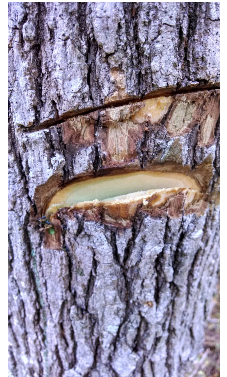
A hack and squirt treatment

In land management, there is an activity that requires year around vigilance. Failure to do so can result in habitat degradation and much higher costs down the road for control. This activity is control of non-native, invasive plants; animals, too, but we will focus on plants right now. Kudzu is a good state-wide example everyone is familiar with. It grows rapidly, will completely take over, it is hard to get rid of, and offers little benefit to anything, except erosion control which is why the USDA brought it here. These are all traits of invasives. Chinese tallow tree, wisteria, japanese climbing fern, and cogon grass are a few more examples. Non-native, invasive plants arrive in several ways: cars and trucks traveling through an infected area to one that is not, people transplanting them, nursery stock, ships, and trains are all ways these