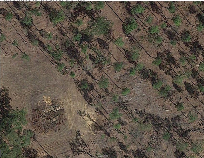
Below: Google Earth imagery at 1,114x848 pixels. The picture covers about 470 feet.