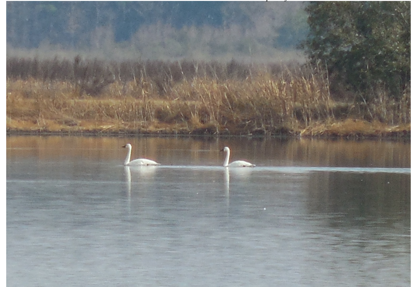
A pair of swans at Bear Island WMA

There are many bird species that are arriving and leaving at this time of year. We have a wonderful area in this part of South Carolina to take advantage of watching many of those birds.