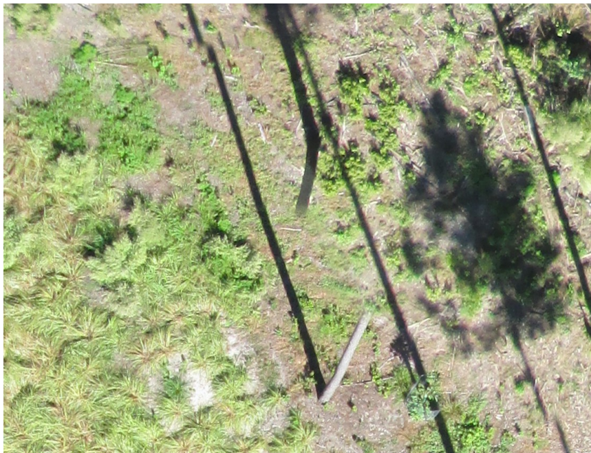
Above: UAV imagery at 1,114x848 pixels. The picture covers about 65 feet.